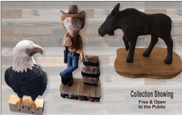
Collection Showing Free & Open to the Public

7070 E. Broadway Mount Pleasant, MI 48858 989-775-4600 www.sagchip.org